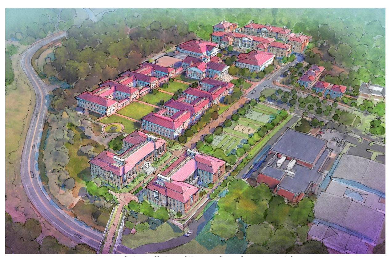
Proposed Overall Aerial View of Darden Vision Plan